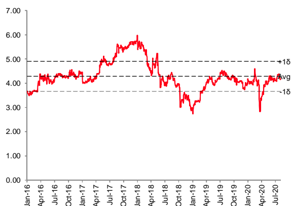
EXHIBIT 4: PE BAND CHART